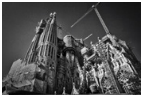
Basilica Sagrada Familia, Barcelona, Italy