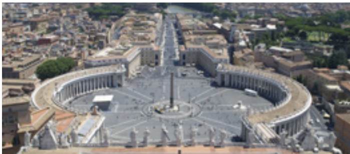
Vatican City, Rome, Italy

Timeless Treasures Ancient Allure Authentic Cuisine Classic Landscapes Magnificent Destinations