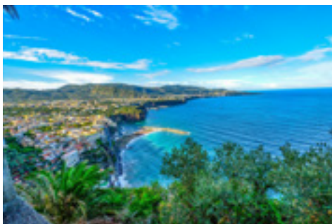
Amalfi Coast, Italy